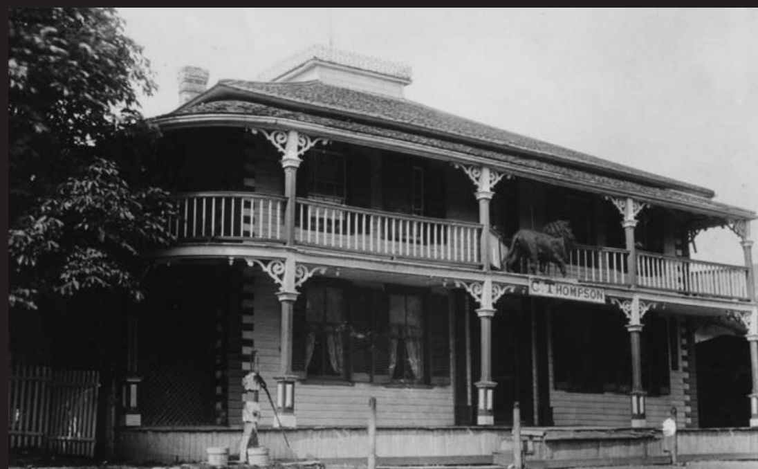
The Golden Lion Hotel, circa 1905, when it was owned and operated by the Thompson family.