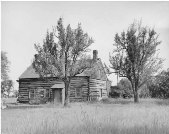
Coulson Cabin, west side Victoria Park Ave. opposite Ellesmere Ave. Toronto, Ont.