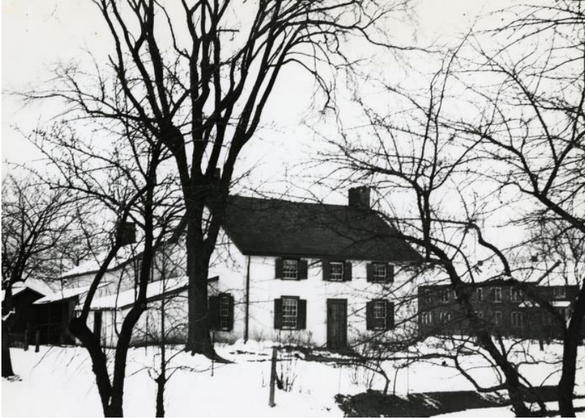
Bales House, south-east view